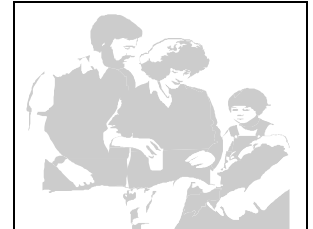
I saw you!

When you thought I wasn't looking, I looked! Yes I am looking at you now and I just wanted to say, "Thanks for all the things I saw when you thought I wasn't looking."