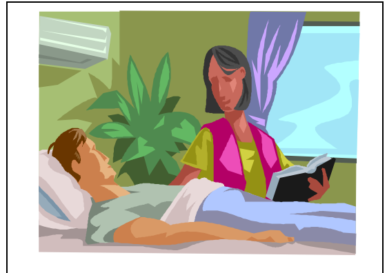
His Teacher made it a point to call on him

It is always a helpful and rewarding experience when teachers invite the children into their homes. Sometimes two or three may be invited to dinner. A teacher may take one or more out for a meal, or for a snack. Such times have deep meaning for a child and add greatly to his sense of personal worth.