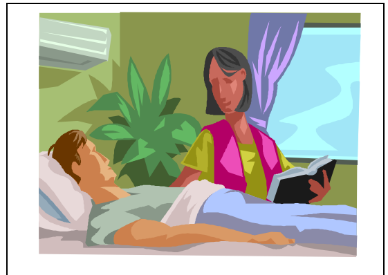
His Teacher made it a point to call on him

It is always a helpful and rewarding experience when teachers invite the children into their homes. Sometimes two or three may be invited to dinner. A teacher may take one or more out for a meal, or for a snack. Such times have deep meaning for a child and add greatly to his sense of personal worth.