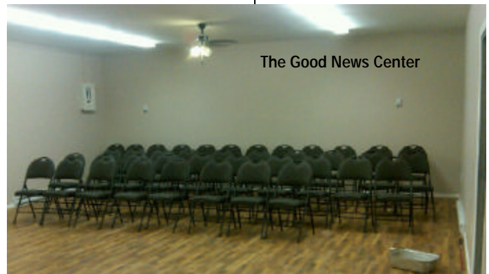
The Good News Center